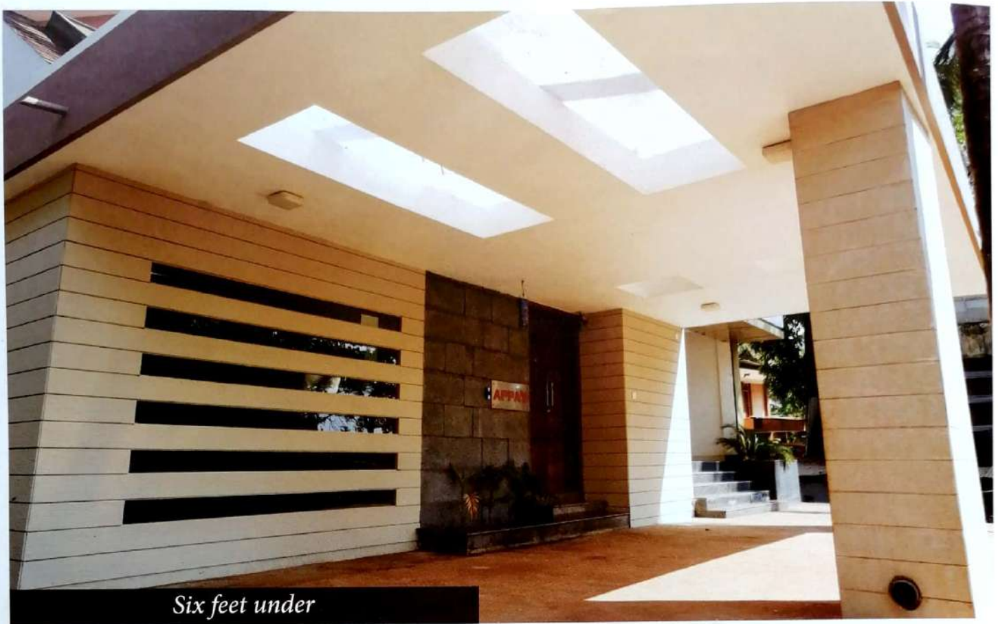
Six feet under